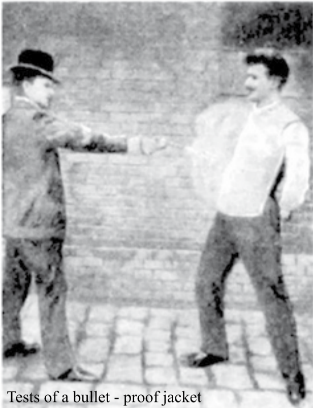
Tests of a bullet - proof jacket

Jan Szczepanik (Born on April 13, 1872 in Rudniki – died on April 18, 1926 in Tarnów, Poland) was Polish inventor. He held several hundred patents and made over 50 discoveries, many of which are still used today, especially in motion pictures industry, photography and television. Because of the amount of the invention and their importance he is known as “Polish Edison”.